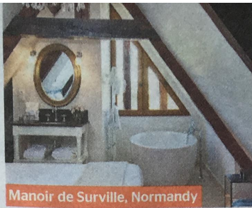
Manoir de Surville, Normandy