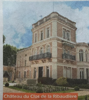
Château du Clos de la Ribaudière

has belonged to her family for more than 200 years. A delicious home-cooked evening meal is served before guests retire to one of four double rooms, each decorated with an individual character and style. Cat lovers will delight in Mme Dussert's many feline friends. Details B&B doubles are from €53 a night. Dinner with wine is €27 (00 33 2 48 96 47 45, sawdays.co.uk)